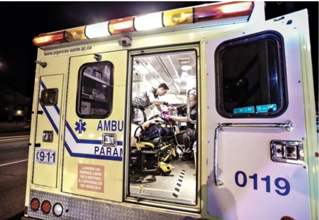
Figure 1 Editorial published in the Canadian Medical Association Journal (16)