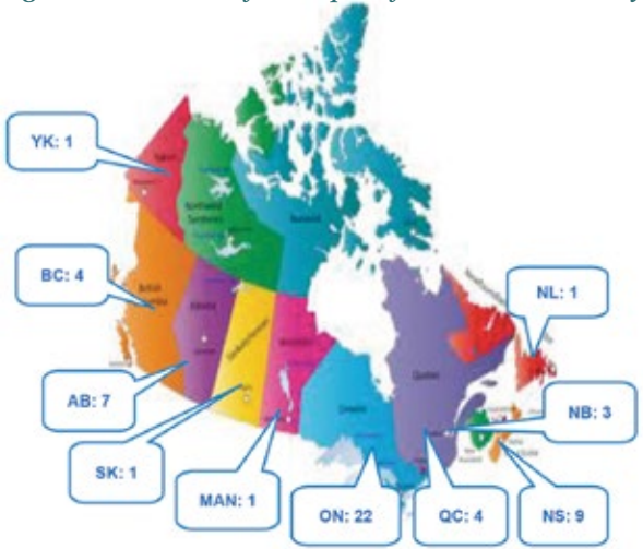
Figure 2. Distribution of Participants from Across the Country

The Capital District Health Authority research ethics board (Halifax, NS) approved the Newfoundland Roundtable session and Delphi consensus survey phases of the study. Written informed consent was obtained at the Newfoundland Roundtable session or via telephone and email for those who did not attend the roundtable. The St. Michael’s Hospital research ethics board (Toronto, ON) approved the key informant interview phase of the study, and the sub-sample who participated in this phase provided verbal informed consent prior to the start of the interview. The methods have been published previously (31).